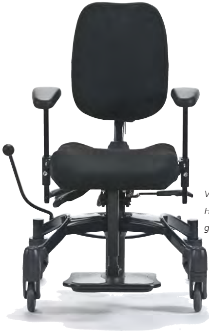
VELA Tango 100S Height adjusted using gas