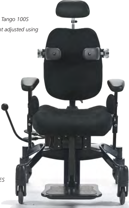
VELA Tango 100ES electric height adjustment