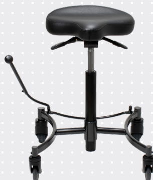
VELA Salsa 130