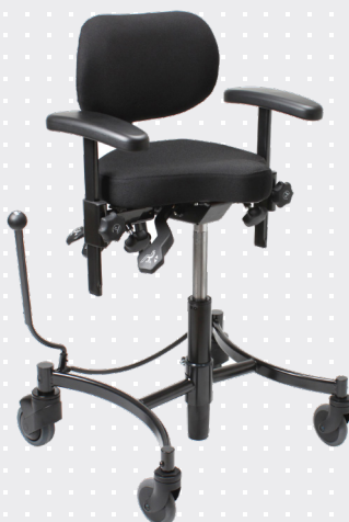
VELA Salsa 120