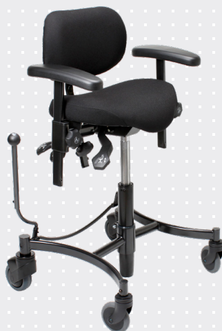
VELA Salsa 100