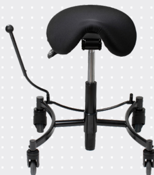
VELA Salsa 400