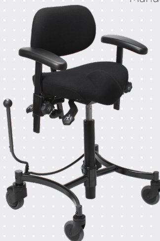
VELA Salsa 110