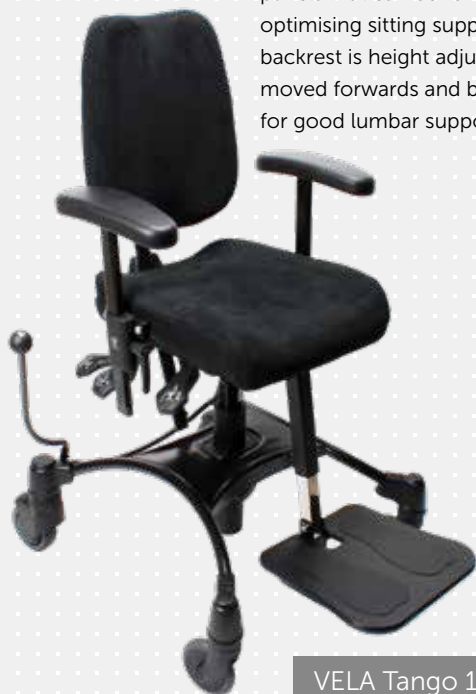
VELA Tango 100S

VELA Tango 100S is supplied as standard with a seat featuring a cavity with foam panels that can be reversed or changed, optimising sitting support for the child. The backrest is height adjustable and can be moved forwards and backwards and tilted for good lumbar support.