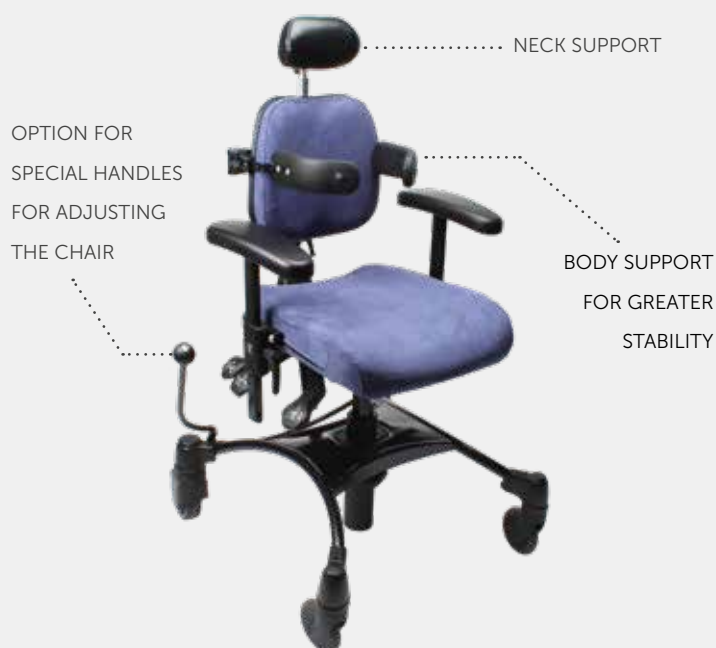
Examples of accessories for VELA Tango 100S

A complete list of accessories is available at www.vela.eu .