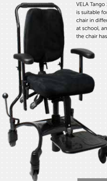
VELA Tango 100S

VELA Tango 100S with a push handle is suitable for children who use the chair in different places, for example at school, and require support when the chair has to be moved.